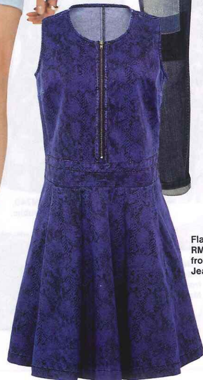
Flare dress, RM730, from DKNY Jeans.