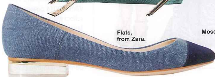
Flats, from Zara.