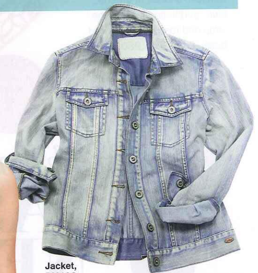
Jacket, RM199, from Jeep.

True blue works overtime this month – and we don't mean just jeans. With subtle watermarks, patchwork and embellished updates, this 90s trend is to dye for.