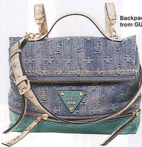
Backpack, from GUESS.