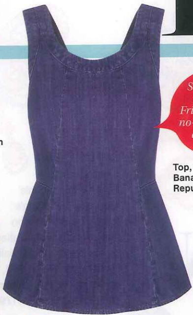
Watch, from Komono.